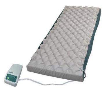
Alternating Air Pressure Mattress