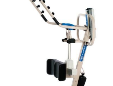
Sit to Stand Lifts