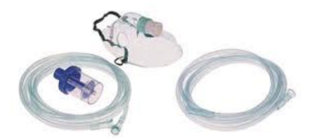
Tubing and Masks