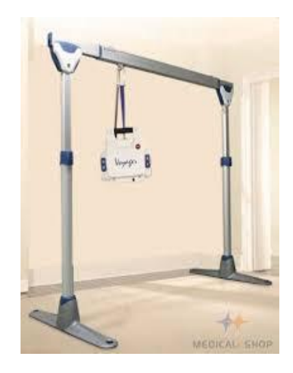
Voyager Two Post Lift Systems