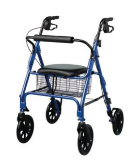
Walkers and Rollator Walkers