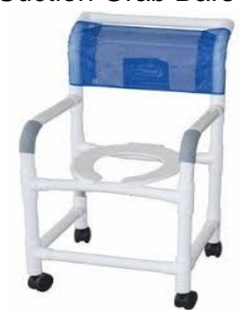
Rolling Shower Chair