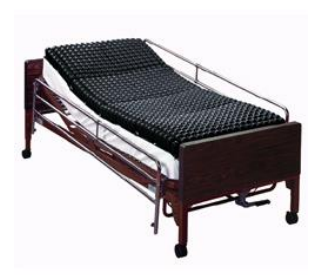
Roho Mattress Overlay Systems