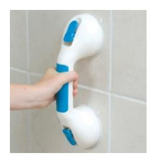
Suction Grab Bars