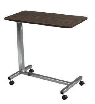
Adjustable Hospital Tables