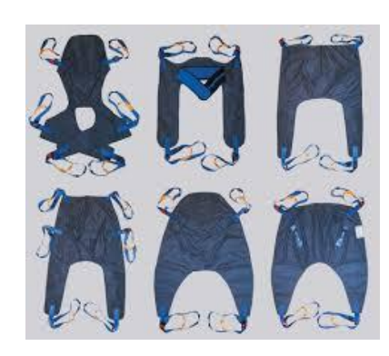
Various Lift Slings