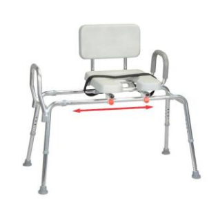
Sliding Shower Benches