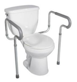
Toilet Safety Arms