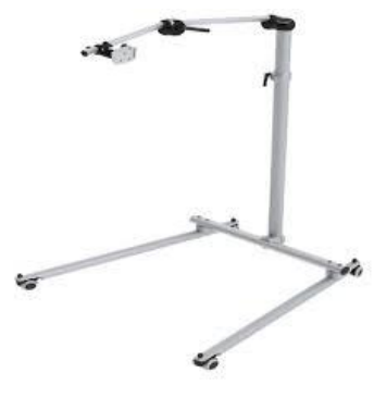
Stands and Mounts